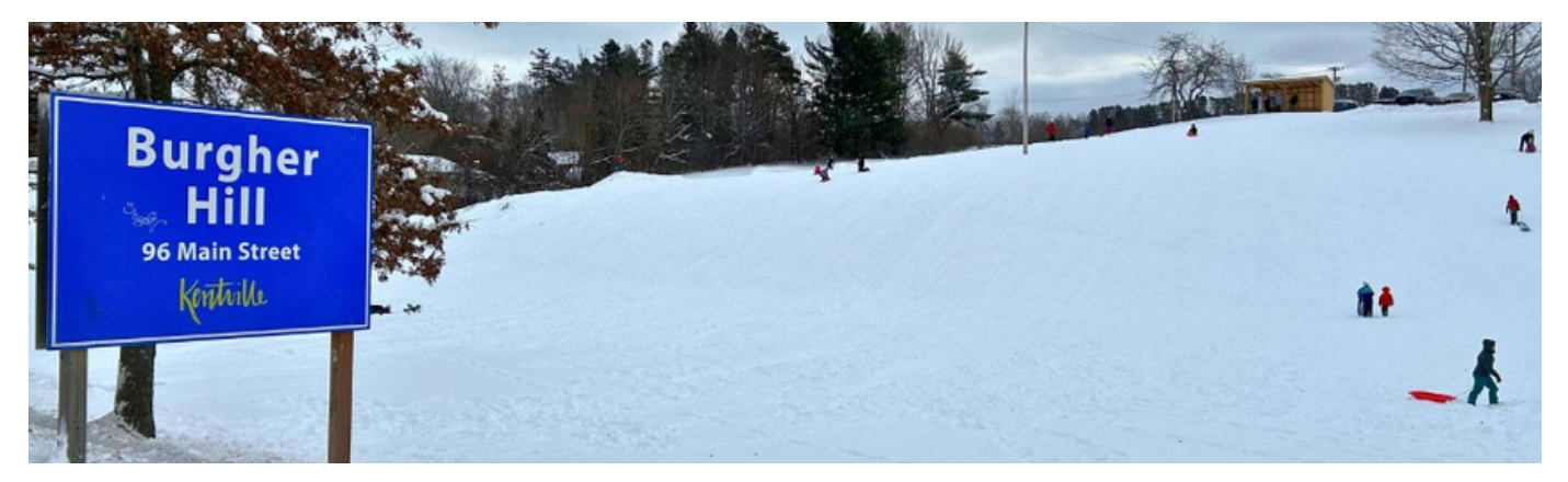
Lots of snow and lots of sledding at Burgher Hill this month!

The monthly municipal update from Kentville Nova Scotia